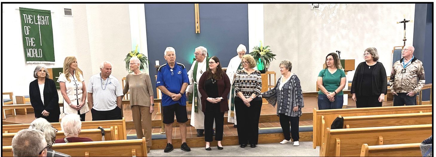
Installation of Church Council Sunday, January 19

Send your SNAPS & SNIPS to licoschurchoffice@gmail.com